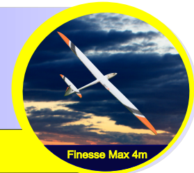
Finesse Max 4m